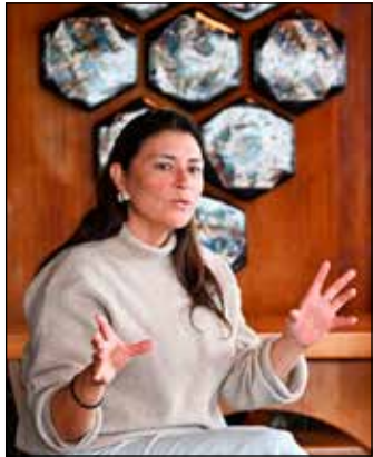
Elisapie Isaac