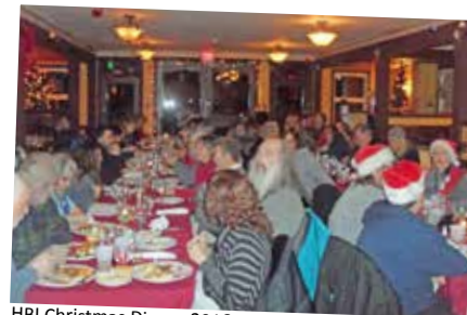
HBI Christmas Dinner 2016

If you are unable to pick up let us know we'll make sure someone gets it to you. (south of Hope Springs Road and working on if further areas if needed)