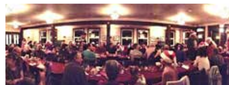
HBI Christmas Dinner 2013