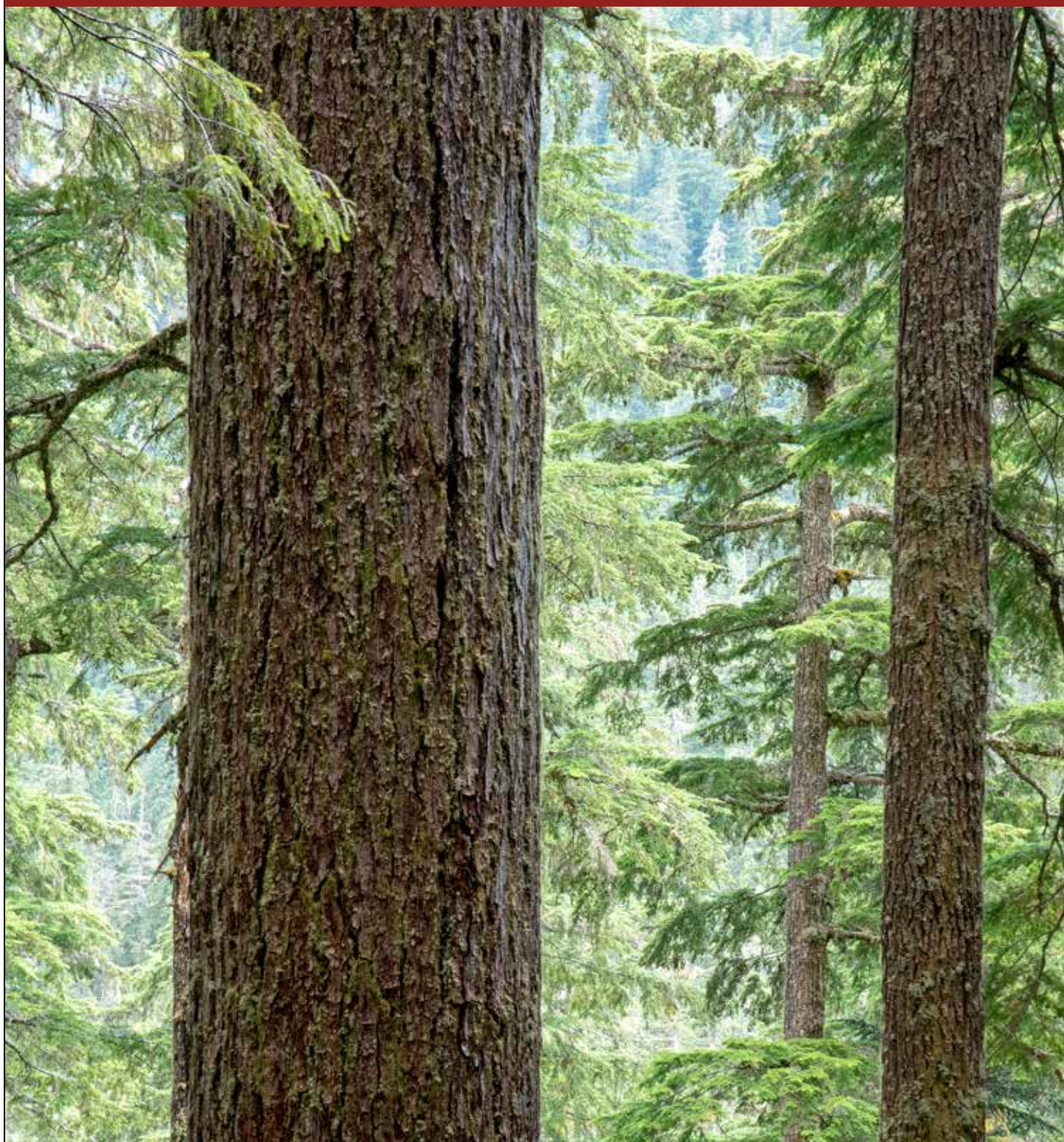
Old-Growth Forest on Vancouver Island.