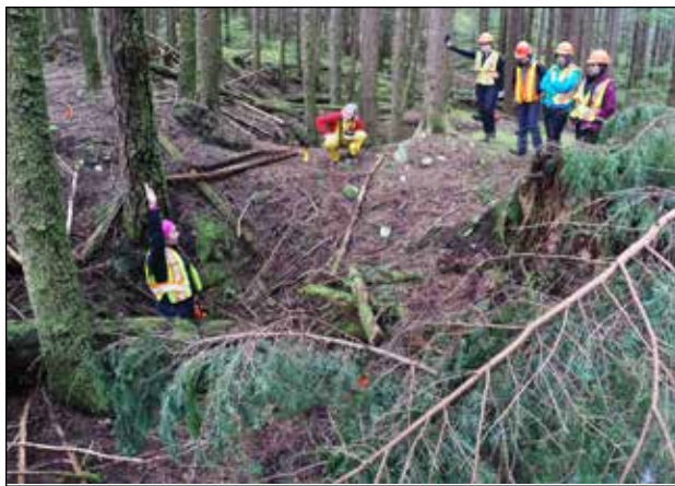
Vancouver Island University karst course students examine karst sinkholes.