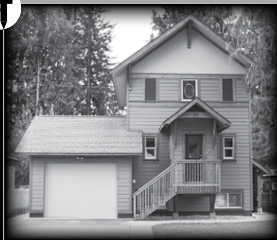
Above: Private home, energy rating ★ 81

SEE MORE OF OUR PROJECTS AT www.jtoelle.com