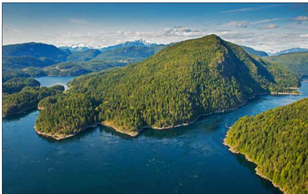
Sonora Island and Hole-In-The-Wall channel

Consistent with their blatant disregard for protecting old-growth in their Great Bear Rainforest tenures, TimberWest has refused to include hundreds of giant trees in their currently proposed protected area (called the Thurlow BMTA). This in spite of the fact that Sonora Island falls into the Great Bear Rainforest Agreements and TimberWest is required to identify and set aside