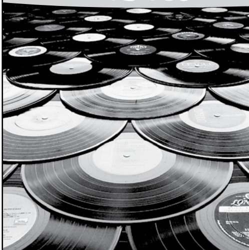
tag #heriotbayinn: your pic might get some legit ink!

Duffy Live rock+roll dance floor • good times • June 27