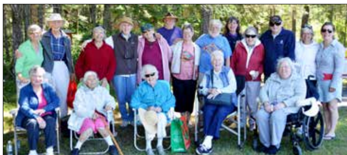
Quadra Circle Picnic at the Spit

Secondly, our Housing Committee, in partnership with Q.I. Seniors Housing Society, will soon receive a small grant from Canada Mortgage and Housing. This will fund a Housing Needs assessment and a feasibility report about