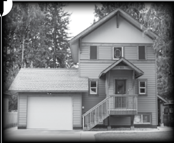
Above: Private home, energy rating ★ 81

SEE MORE OF OUR PROJECTS AT www.jtoelle.com