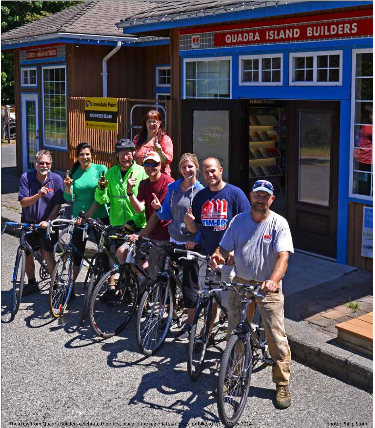
The crew from Quadra Builders celebrate their first place in the regional standings for Bike to Work Week 2014