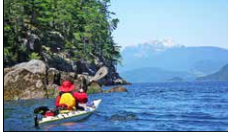
Paddling in the Discovery Islands by Norris Weimer

The upcoming Outdoor Club events for the next few weeks are: