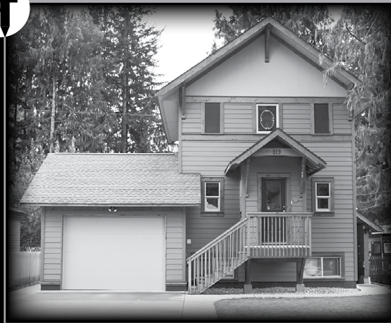
Above: Private home, energy rating ★ 81

SEE MORE OF OUR PROJECTS AT www.jtoelle.com