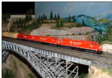
North Island Model Railroaders, February 23-24, at the Museum at Campbell River

"ChooChoo -Attention passengers, next stop Campbell River!" It's that time of year again – the North Island Model Railroaders annual show at the Museum at Campbell River is back! On Saturday and Sunday, February 23rd and 24th, from 12 noon to 5 pm (12 – 4 pm on Sunday), the community is invited to come see the excitement of model trains. The show is amazing - everyone that attends walks away impressed and this year's show will prove to be as interesting as ever. There is