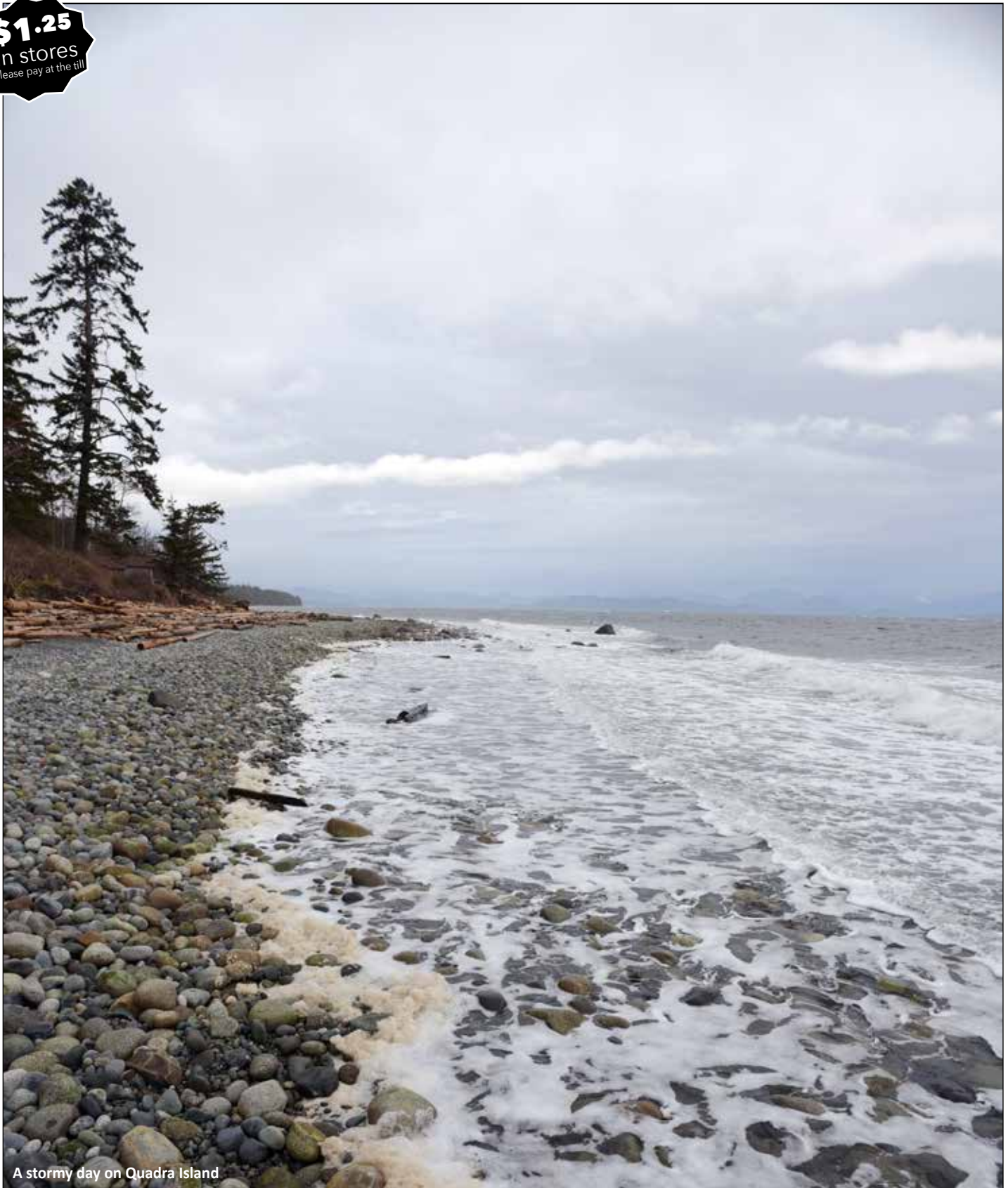
A stormy day on Quadra Island