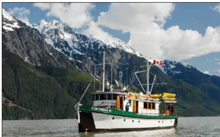
The historic Columbia III

Every one of these destinations is memorable, says Taylor, but Bute Inlet is especially grand. It's a very long inlet, piercing deep into the Coast Mountains, with snow-capped mountains that are among the highest in the province.