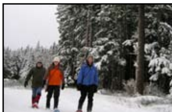
Winter fun on the Community Centre trails