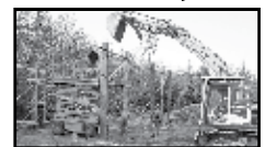
Midsize Kubota with thumb and blade 11 ton Cat for larger projects