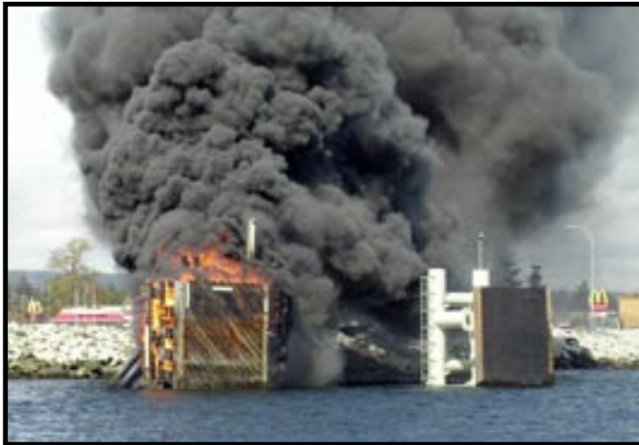
#3 Dolphin at the Campbell River ferry terminal caught fire Monday April 23rd.