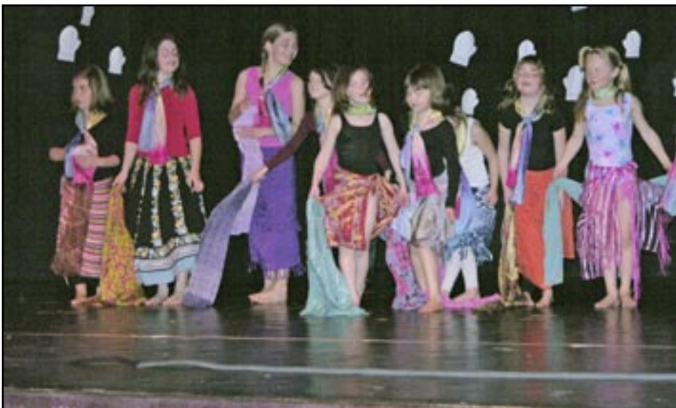
'The Mitten' World Dance for Children performers take a bow at QCC on April 13.

Thanks so much and we look forward to seeing you around.