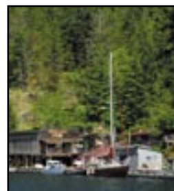
Refuge Cove, E. Redonda Is.