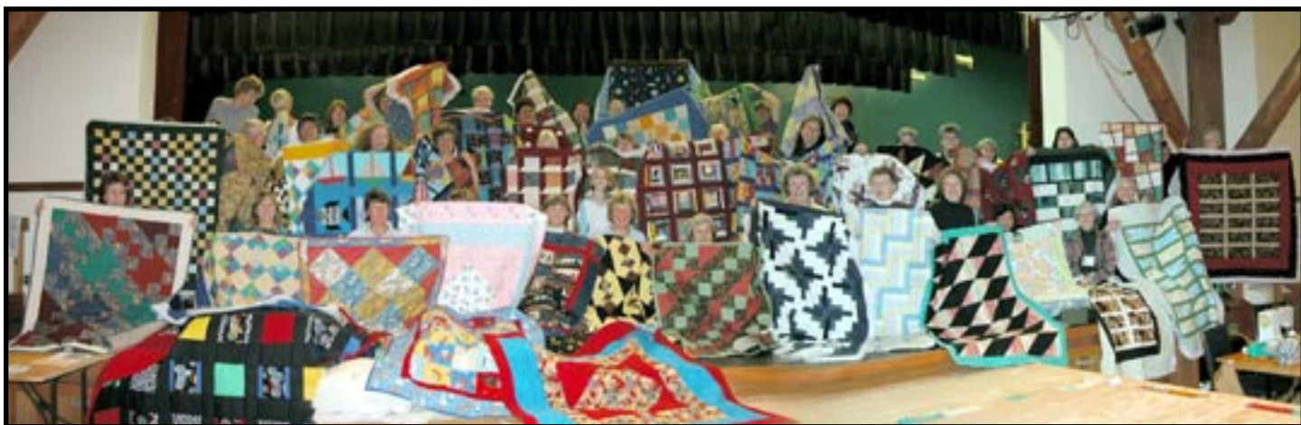
Fruits of their labour. Quadra Quilters show off some of the beautiful quilts created during their marathon quilting weekend.

The Comox Valley Potter's Club is a non-profit organization promoting the craft of pottery in the Comox Valley.