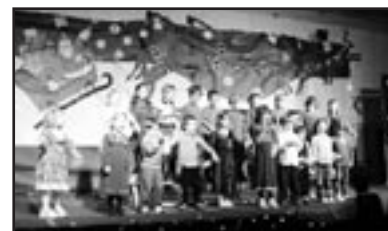
K/Gr 1 Class at the Quadra School Christmas Concert