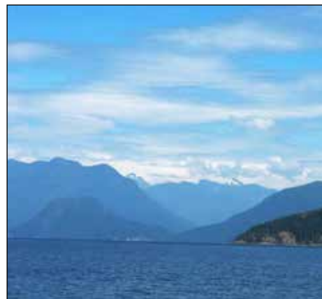
Beautiful Desolation Sound

Hard to believe that Fall is approaching – but it isn't here yet! And for many, the best month to be on the water is September. The Museum at Campbell River will offer its final Historic Boat Tour on Sunday, September 15, from 9 am to 2 pm. This last trip of the season will visit the amazing region of Desolation Sound. This Desolation Sound trip will swing by Mitlenatch Island, travel through Desolation Sound, then head up Waddington Channel between East and West Rodonda Island. From there, the boat will pass by Toba Inlet, continue on through Pryce Channel to Sutil Channel, following along the shores of Read and Cortes Island before rounding Cape Mudge and returning to Campbell River. The cost for this tour is also $130.00 and includes on-board historic interpretation and a light picnic lunch. Desolation Sound is considered one of the premier cruising destinations on the Northwest Coast. These historic trips are offered through a partnership between the Museum and Discovery Marine Safaris. Please call the Museum at 287-3103 to register. One last chance to get on the water this summer!