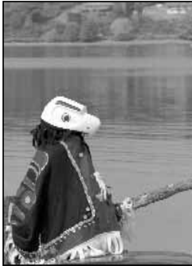
Cover: Myths, Fantasys and Fairytales, ancient lore from the islands.